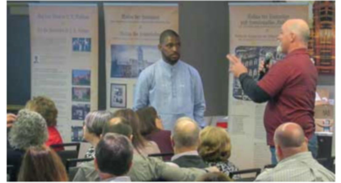
Advocacy-focused programming brought important topics to the forefront at the 2018 CHHSM Annual Gathering.