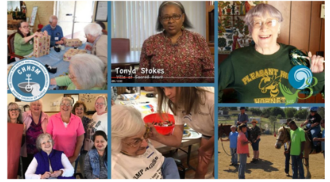
CHHSM member ministries embody the 3 Great Loves in everyday acts of kindness.