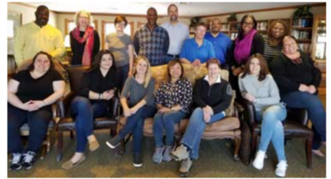
The Class of 2018 Nollau Students on their first retreat.

295 individuals across 6 member ministries participated in Nollau To You with an additional 15 people comprising the 2018 class of the Nollau Leadership Institute.