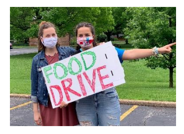
Volunteers from Eden Theological Seminary participating in a food drive